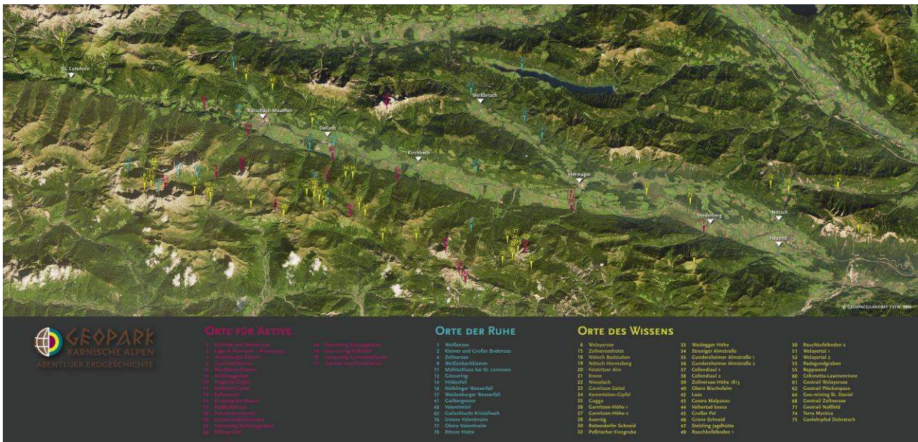
The GeoPark Carnic Alps and its Geotopes

At present in Europe 52 Geoparks from 18 countries are officially designated Geoparks. As of Oct. 2012, 90 Geoparks in 27 Member States are currently members of the Global Geoparks Network assisted by UNESCO.