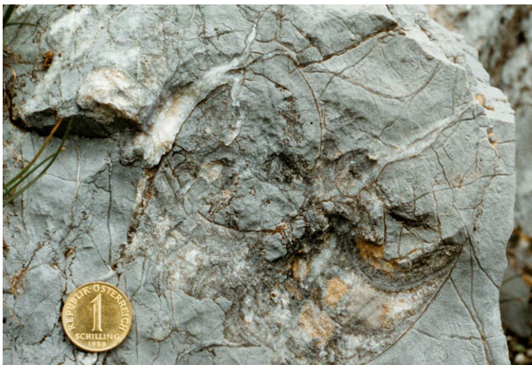
Limestone slab with a goniatic, forerunner of Mesozoic ammonites.

The southern foresummit of Großer Pal (Pal Grande) has an altitude of 1760 m. The whole area in the surrounding of the border rock n-155 has been described in great detail during the last years and several short sections were measured and macro- and microfossils were collected and processed. In the meantime, in particular, the distribution of conodonts, trilobites and ammonoids has been well documented. They occur in well-bedded greyish and fine-grained limestones of Upper Devonian age (370 to 390 m.y. BP), which display a net-like structure on the surface caused by clay interpartings. Though very abundant, the fauna is rather small when compared with coeval faunas from other regions. This dwarfism may suggest a deep-water environment.