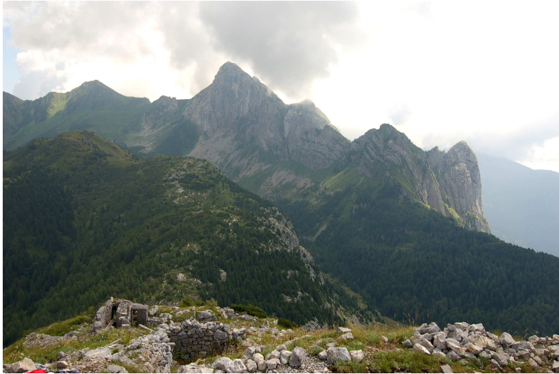
View from Kleiner Pal to Großer Pal, Pizzo di Timau at the back

The southern foresummit of Großer Pal (Pal Grande) has an altitude of 1760 m. The whole area in the surrounding of the border rock n-155 has been described in great detail during the last years and several short sections were measured and macro- and microfossils were collected and processed. In the meantime, in particular, the distribution of conodonts, trilobites and ammonoids has been well documented. They occur in well-bedded greyish and fine-grained limestones of Upper Devonian age (370 to 390 m.y. BP), which display a net-like structure on the surface caused by clay interpartings. Though very abundant, the fauna is rather small when compared with coeval faunas from other regions. This dwarfism may suggest a deep-water environment.